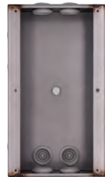
FOND ENCASTRABLE MAYLIS LIAISON Flush-mounted bottom for prison intercoms of Maylis range REF 550.0550