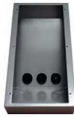
SUPPORT XE PLATINE AUDIO Inclined desk stand for XE PLATINE AUDIO REF 500.9266