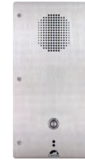
XE-1B-CELL-SENS Audio Full IP/SIP cell intercom with 1 call button and sensitive front panel REF 550.5510