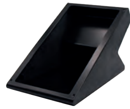
SUPPORT XE PLATINE TOUCH Inclined desk stand for XE PLATINE TOUCH and EXTENSION 18 TOUCHES REF 595.5050