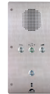
XE-1B-CELL-RADIO Audio Full IP/SIP cell intercom with 1 call button and radio function REF 550.6000