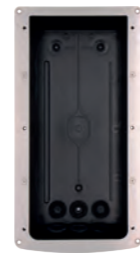
FOND ENCASTRABLE XE PLATINE AUDIO Flush-mounted bottom for XE PLATINE AUDIO REF 590.9860