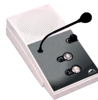
KIT INTERPHONE DE GUICHET PLATINE AV Kit with an operator station and a client (visitor) station vandal-proof version REF 470.9300