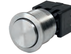
INTER ECLAIRAGE CELLULE Cell light control switch REF 102169