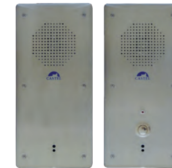
POSTES PARLOIR Stations for visiting rooms prison REF 480.8000 REF 480.8100