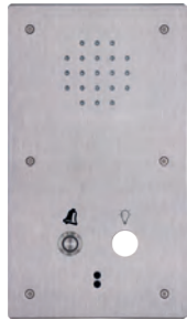
XE-1B-CELL-L Audio Full IP/SIP cell intercom with 1 call button and 1 pending place for lighting control REF 550.0905