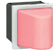
VOYANT HUBLOT LED ROUGE 24V Low-energy red LED light indicator REF 102164