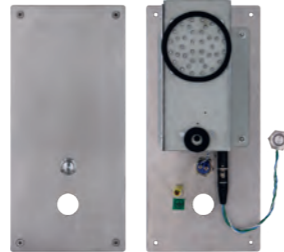
XE-1B-HUISSERIE Full IP/SIP cell kit for frame integration REF 550.0600