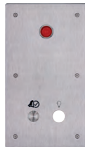
PL-1B-COR-H-L Corridor station with 1 acknowledgement button, 1 light indicator and 1 pending place for lighting control REF 550.0965