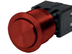
INTER COUPEURE GENERALE CELLULE Eco Energy switch REF 102163