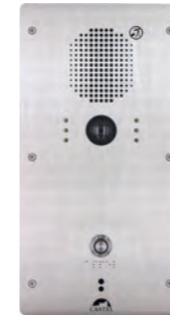
XE-V1B-CELL-ADAPT Audio video Full IP/SIP cell intercom DDA compliant REF 550.5410