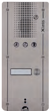
XLESS AUDIO 1B Audio intercom station with 1 call button, anti-vandal and DDA compliant REF 620.0000