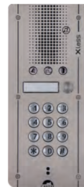
XLESS AUDIO 1B CLAV Audio intercom station with 1 call button and keypad, anti-vandal and DDA compliant REF 620.3000