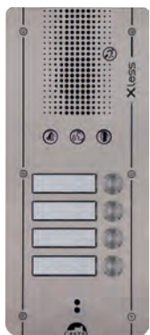
XLESS AUDIO 4B Audio intercom station with 4 call buttons, anti-vandal and DDA compliant REF 620.2000