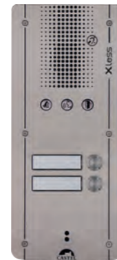
XLESS AUDIO 2B Audio intercom station with 2 call buttons, anti-vandal and DDA compliant REF 620.1000