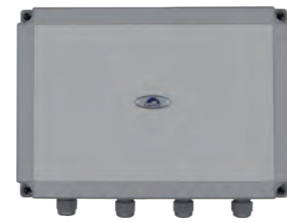
IPS2 GSM EXT Outdoor GSM interface REF 670.1000