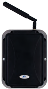
IPS2 GSM GSM interface REF 670.0000