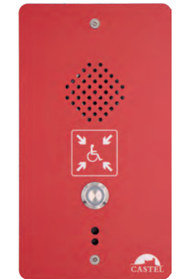
Secondary REFUGE station