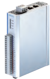
PPMS BOX 6E6S IP Box including 6 input / 6 output with power supply + license REF 360.2000