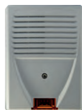
PPMS VOICE EXT Outdoor siren and vocal messages player for PPMS REF 360.8060