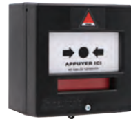
PPMS DM Black manual trigger for PPMS single contact REF 360.8000