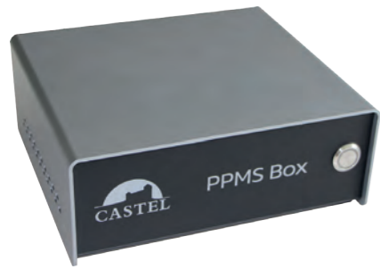
PPMS BOX PPMS Notification central REF 360.1000