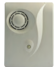
PPMS VOICE INT Indoor siren and vocal messages player for PPMS REF 360.8050